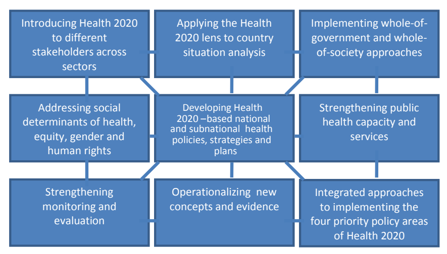
Fig. 2. The nine package components of Health 2020

Health 2020 provides evidence-informed solutions to all these challenges. To facilitate its work with countries and to support Health 2020, the WHO Regional Office for Europe is constructing a package of services and tools that will offer countries systematic support in